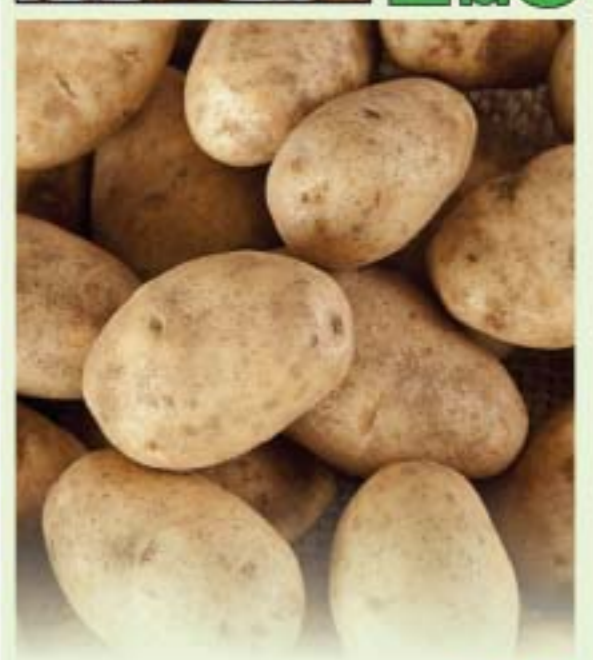
Potatoes 5 lb. bag