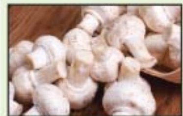
Monterey Whole Mushrooms 8 oz.