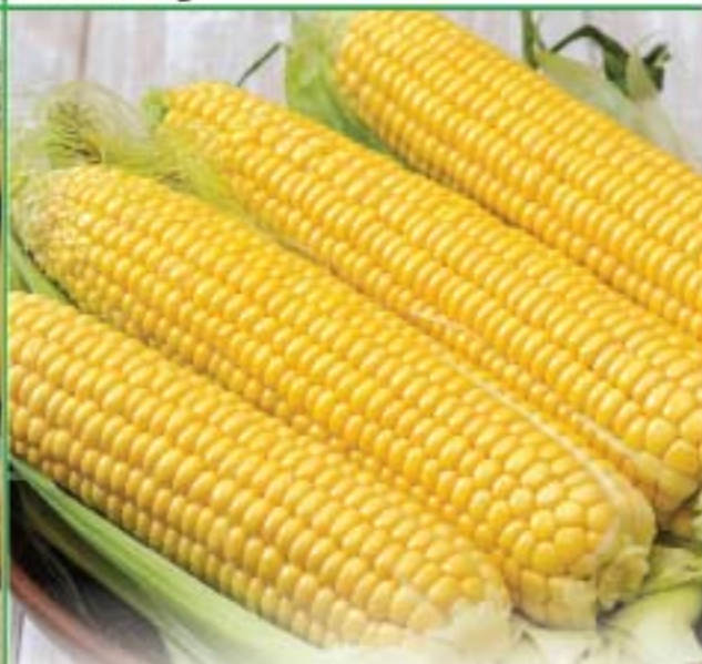
Sweet Corn 4 count