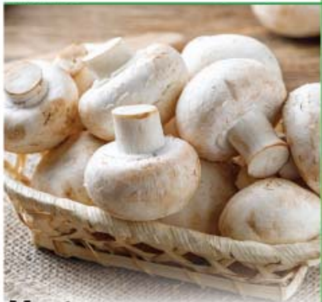
Monterey Whole Mushrooms 8 oz.