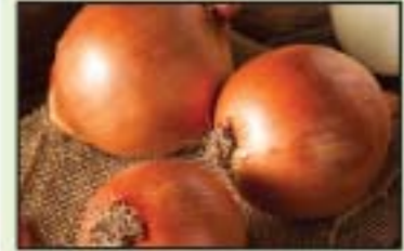
Yellow or Brown Onions