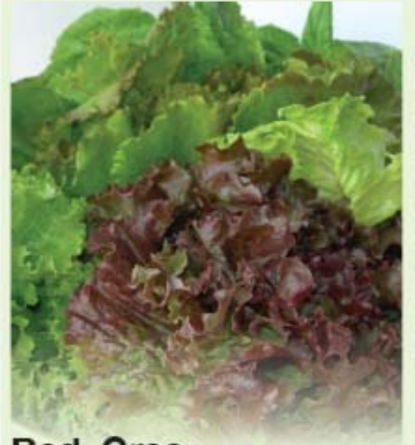
Red, Green Leaf or Romaine Lettuce

Wednesday & Thursday October 23rd & 24th