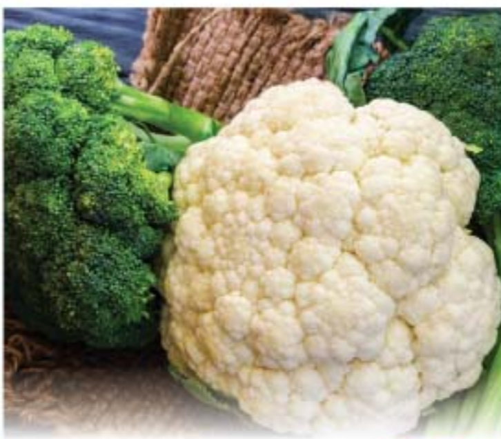
Broccoli or Cauliflower