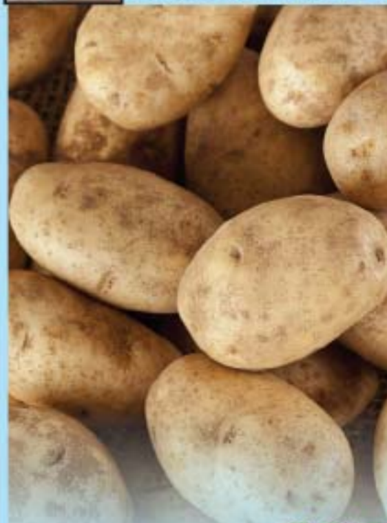
Potatoes 10 lb. bag