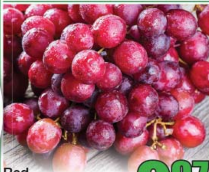
Red Seedless Grapes