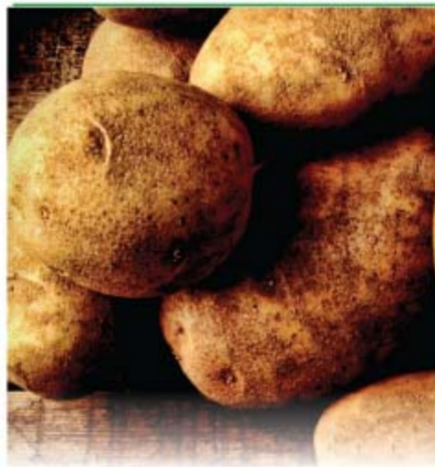
Premium Russet Potatoes