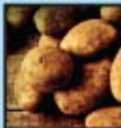
Premium Russet Potatoes