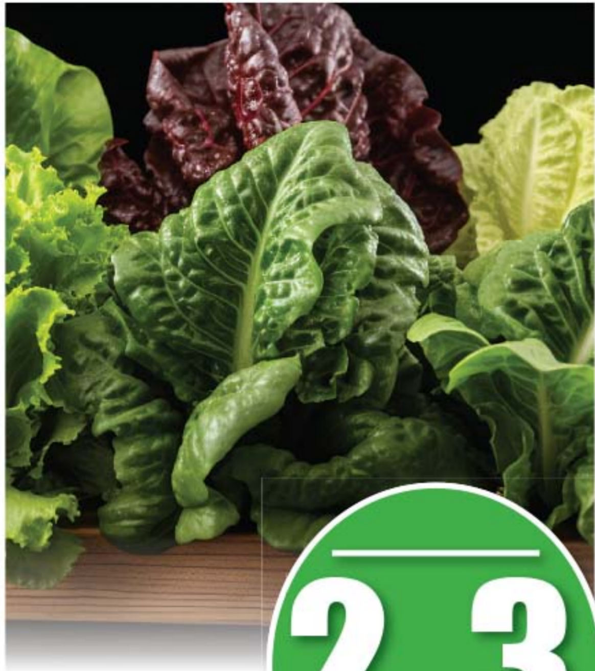
Romaine, Red or Green Leaf Lettuce