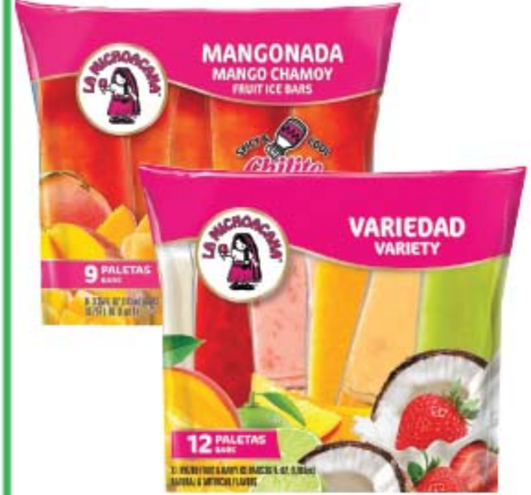
La Michoacana Fruit Ice Bars 12 ct. or Mangonada 9 ct.