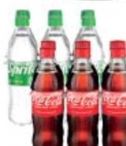
Coca-Cola 6 pack, .5 liter bottles