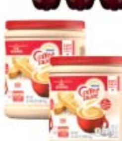
Coffeemate Powder 35.3 oz.