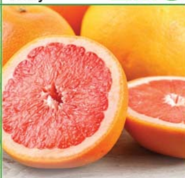
Pink Grapefruit 5 lb. bag