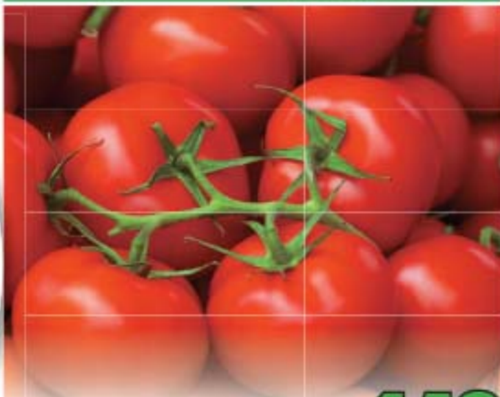
Hothouse Tomatoes On the Vine