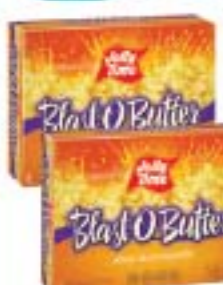
Jolly Time Blast O Butter Popcorn 6 pack