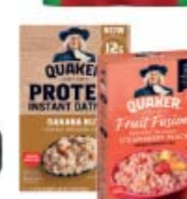
Quaker Protein or Fruit Fusion Instant Oatmeal 8 count