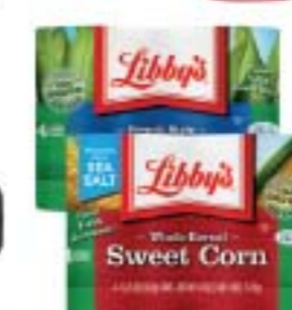
Libby's Vegetable 4 pack cans