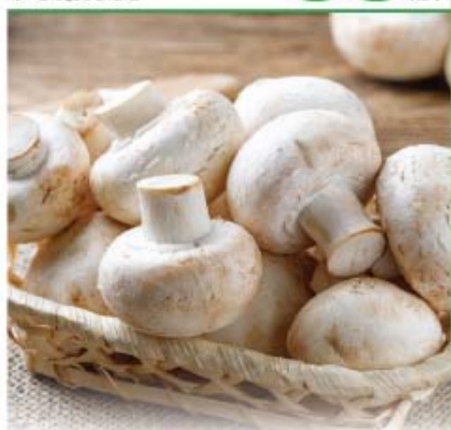
Monterey Whole White Mushrooms 8 oz.