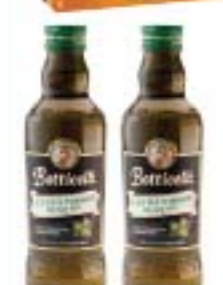
Botticelli Extra Virgin Olive Oil 16.9 oz.