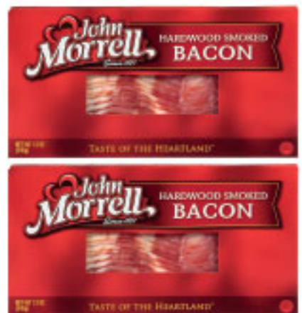
John Morrell Bacon 12 oz.