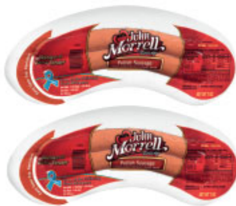
John Morrell Smoked Sausage 7 oz.