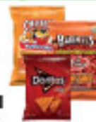
Frito-Lay Single Packs 1.75-4 oz. or Baken-Ets, Sabritas, Chester's or Munchos • 4-6 oz.