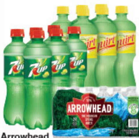
Arrowhead Spring Water 24 pack, 16.9 oz. or Squirt or 7-Up 6 pack, 16.9 oz.