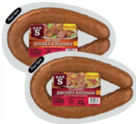
Bar-S Polska Kielbasa or Smoked Loop Sausages 13 oz.