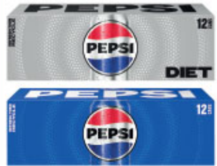
Pepsi 12 pack