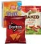
Jolly Time Popcorn 9-9.8 oz. or Frito Lay Singles 1.875-4 oz.