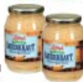
Libby's Sauerkraut 32 oz. glass jar