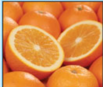
Large Navel Oranges