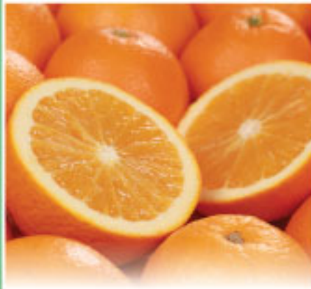
Large Navel Oranges