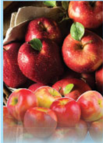
Red Delicious or Fuji Apples

Wednesday & Thursday, February 14th-15th, 2024