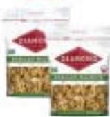
Diamond Shelled Walnuts 32 oz.