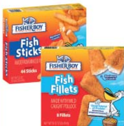
Fisher Boy Fish Sticks or Breaded Fillets 16-22 oz.