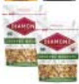
Diamond Chopped Walnuts 8 oz.