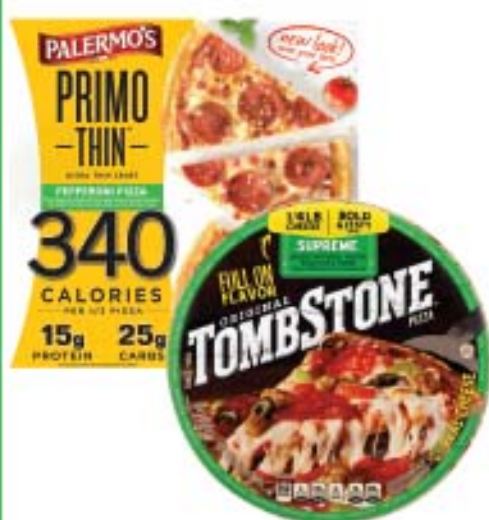
Palermo's or Tombstone Pizzas assorted