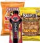
Body Armor 28-31 oz. or Baken-ets, Sabritas, Chester's 4-6 oz.