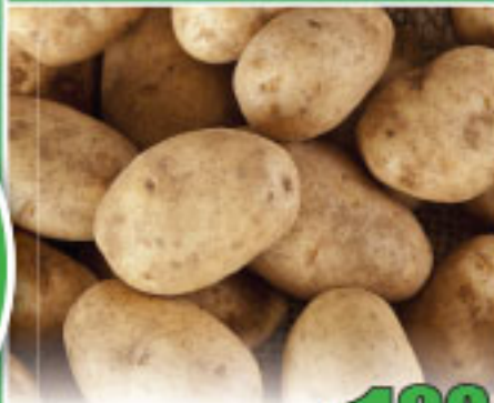
Potatoes 5 lb. bag