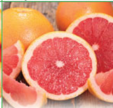
Pink Grapefruit 10 lb. bag