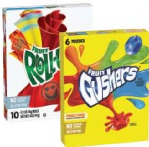
Betty Crocker Fruit Roll-Ups, Snacks, Gushers or Mott's 4.5-8 oz.