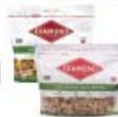
Diamond Chopped or Shelled Walnuts 14-16 oz.