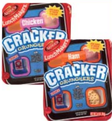
Armour LunchMakers 2.6-2.9 oz.