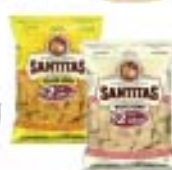
Santitas 10.5-11 oz.