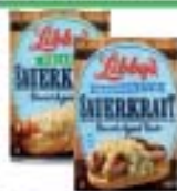
Libby's Sauerkraut 14.5-15 oz.