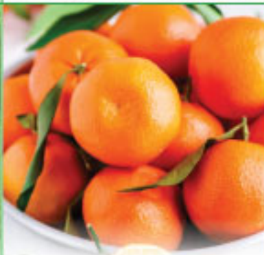
Mandarins 2 lb. bag