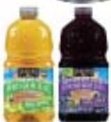
Langers Grape or White Grape Juice 64 oz.