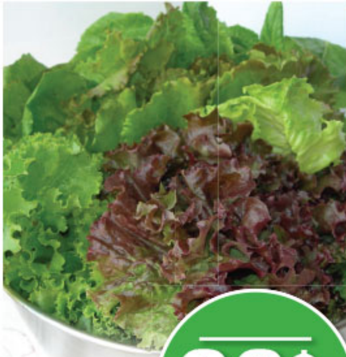
Red, Green Leaf or Romaine Lettuce