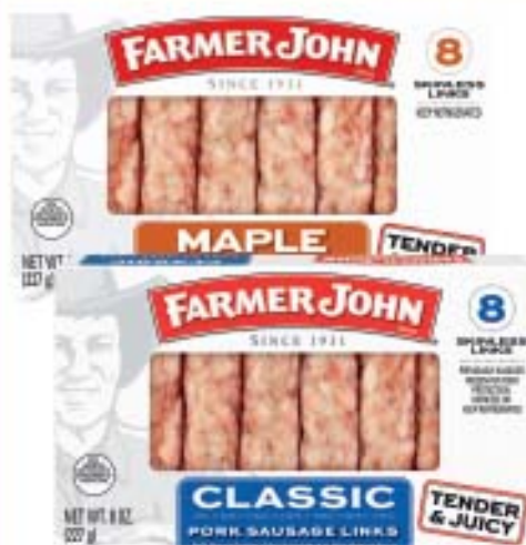
Farmer John Skinless Links 8 oz.