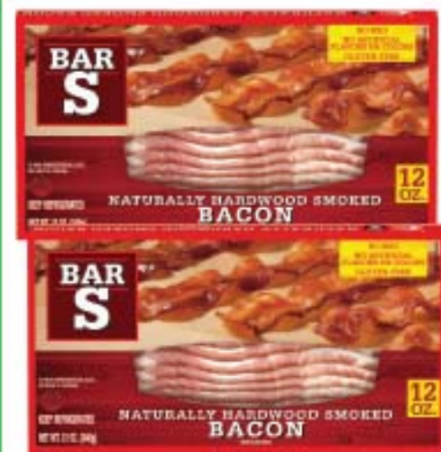
Bar-S Bacon 12 oz.