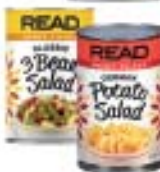
Read Potato Salad 15 oz.