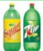
Squirt or 7-Up 2 liter